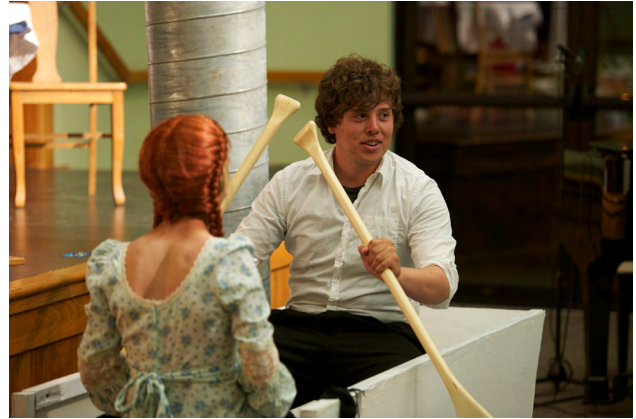
Anne of Green Gables being rescued with a rowboat.

ment of limits and recognition, and function with less routine and fewer expectations, they are apt to lose some of the growth they have achieved.