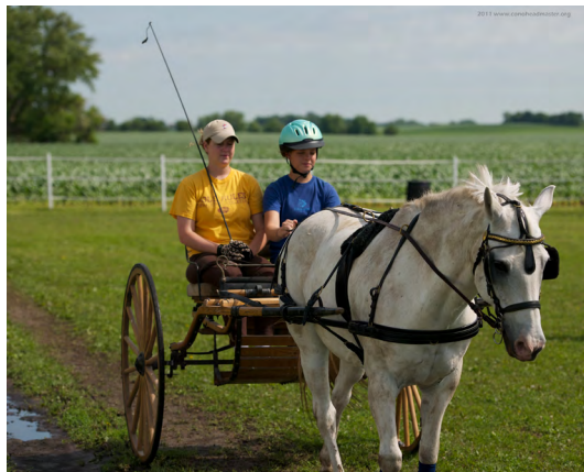
Eclipse driving straight.

At Cono, our students have the potential to lose more than just academic growth. During the school year, students have worked hard to grow socially and emotionally as well as academically. We actively seek to build maturity in our students. When they leave the structured environ-